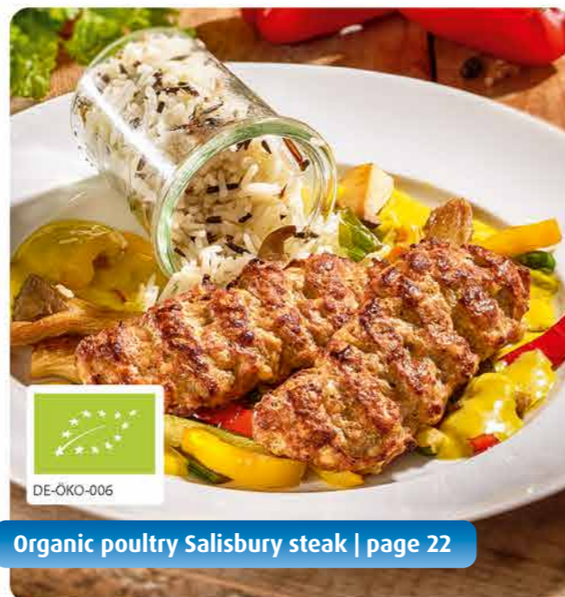
Organic poultry Salisbury steak | page 22