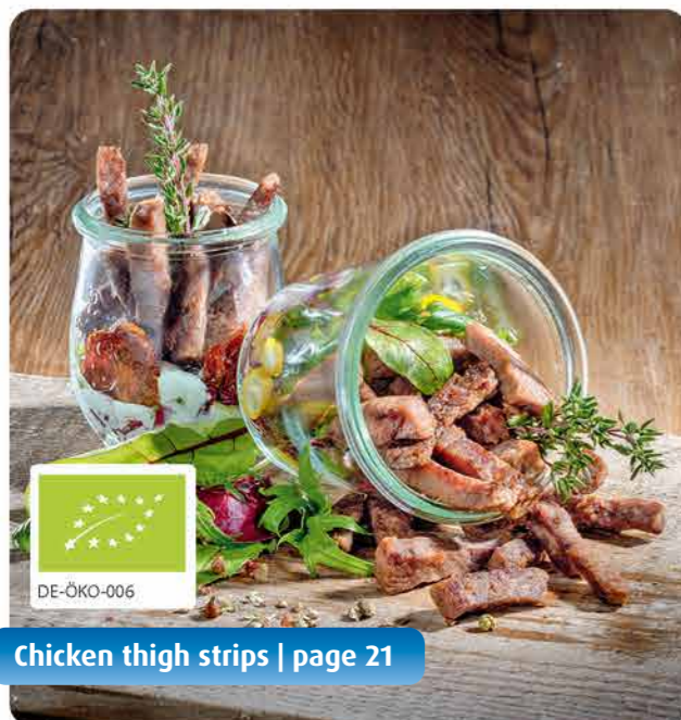
Chicken thigh strips | page 21