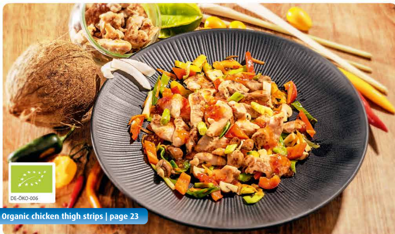
Organic chicken thigh strips | page 23