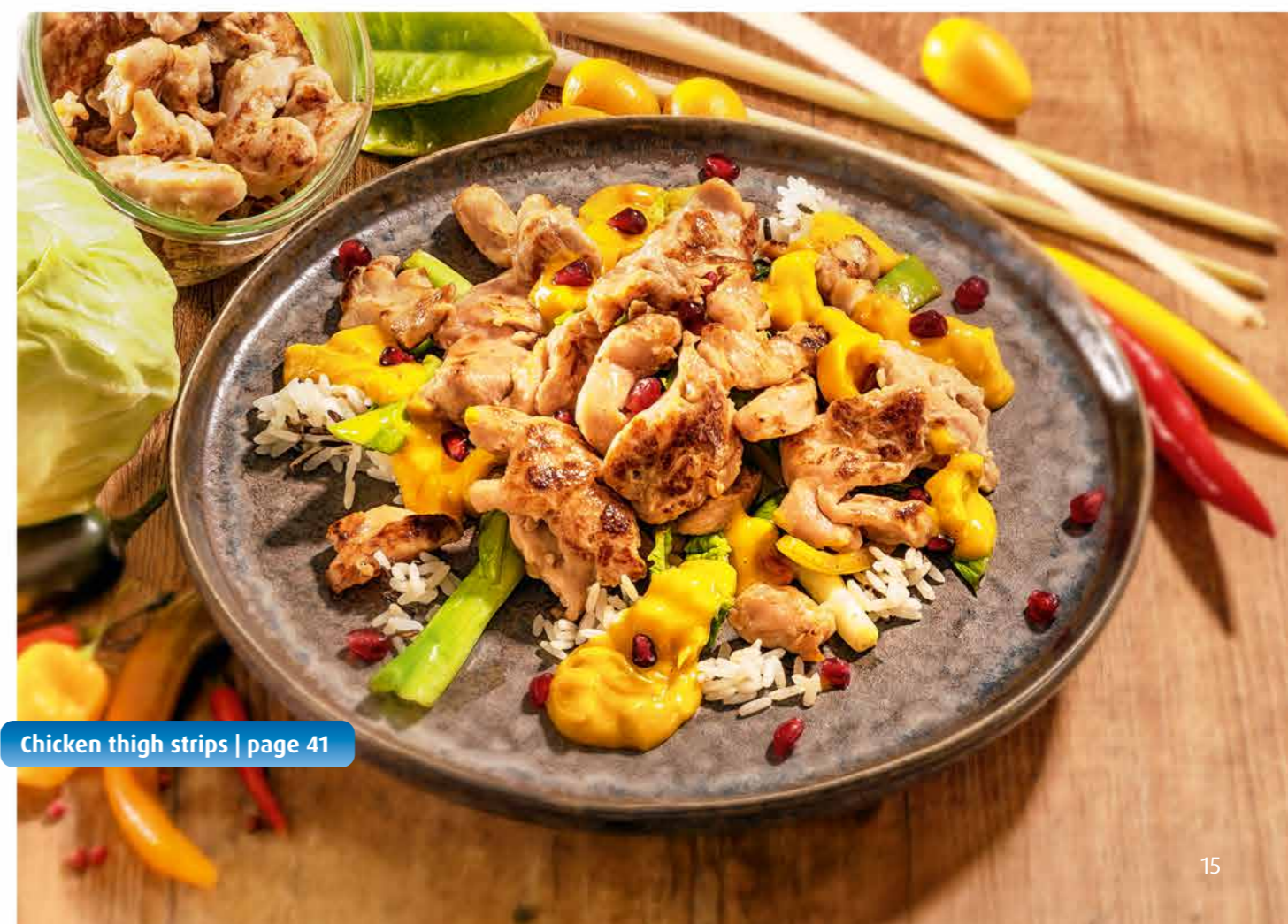
Chicken thigh strips | page 41